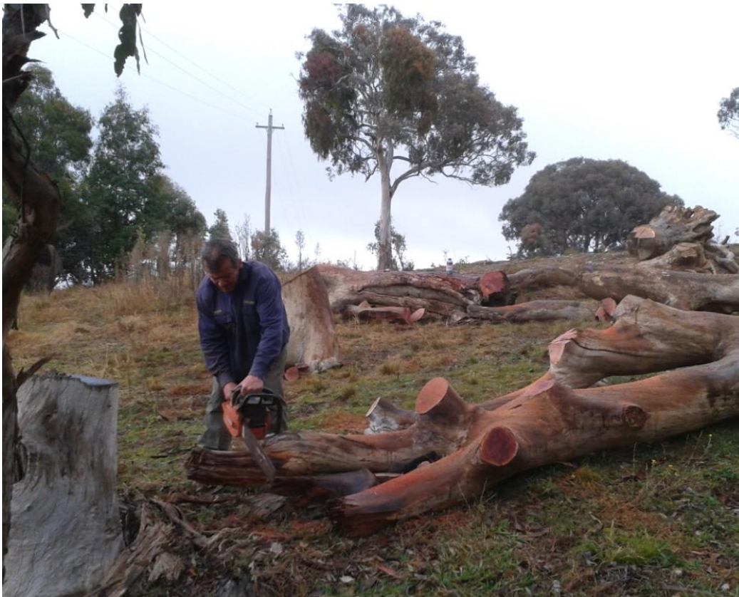
Maestro Mick Rummery sculpting an impressive log section.