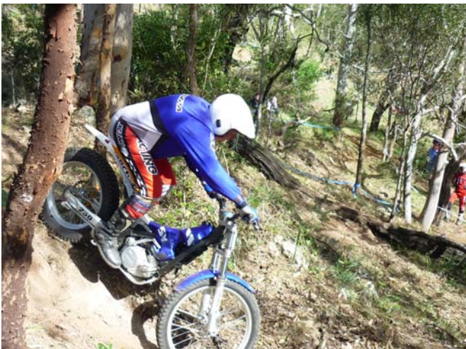
It feels a lot steeper than it looks.